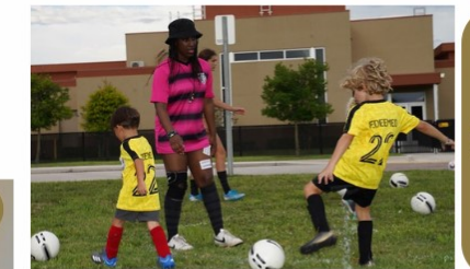
DELRAY BEACH, FL