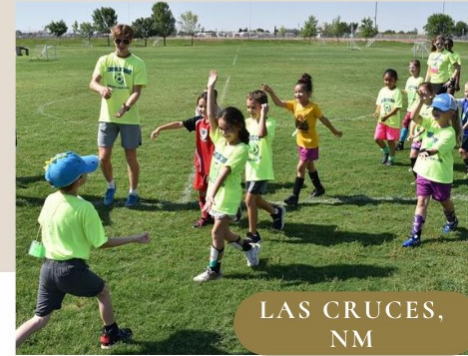
LAS CRUCES, NM