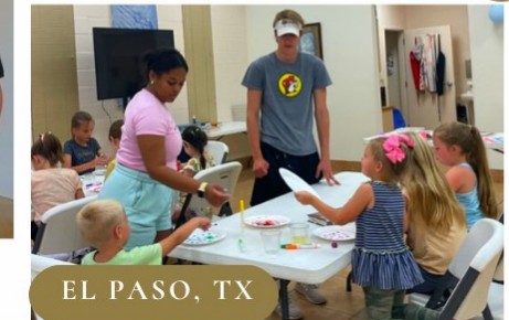
EL PASO, TX