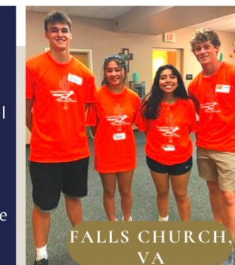
FALLS CHURCH, VA